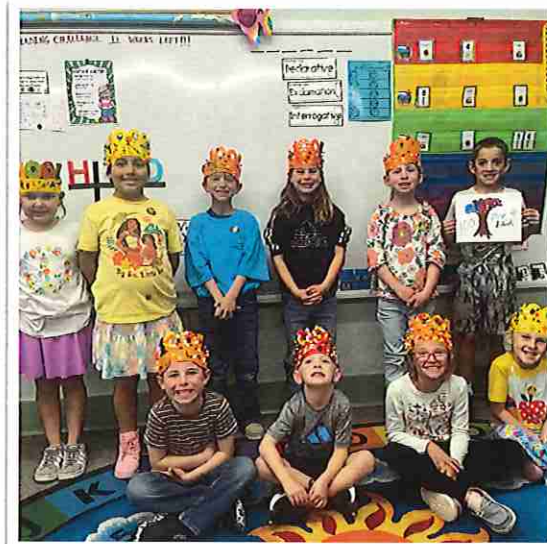
Students in the "Little Room" celebrated the 100th day of School on February 5th