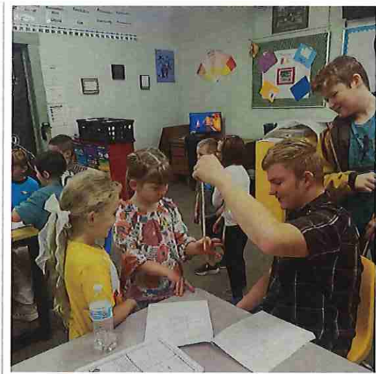
Bigs and Littles working together to complete a Science experiment measuring reaction times.